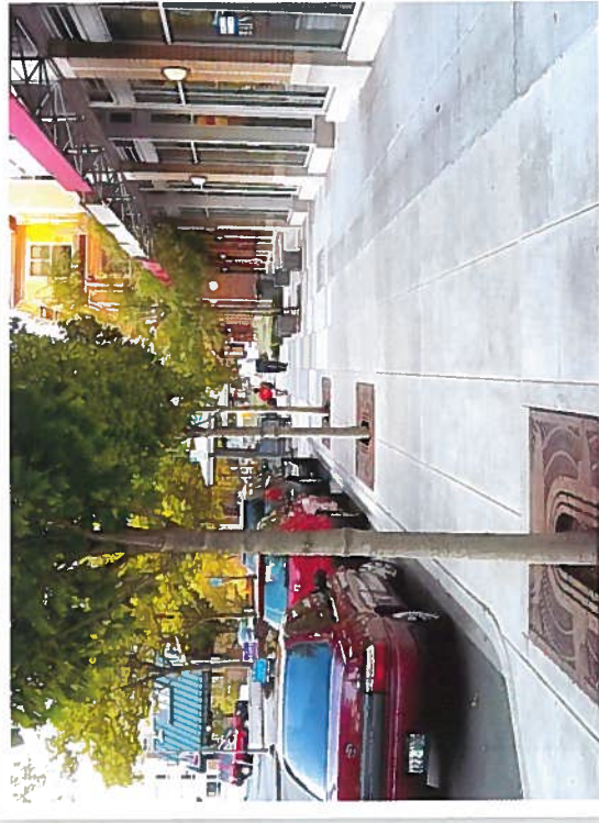
Main Street (56 th Avenue) will have wide sidewalks similar to this street.

The "Main Street" Revitalization Project will provide significant