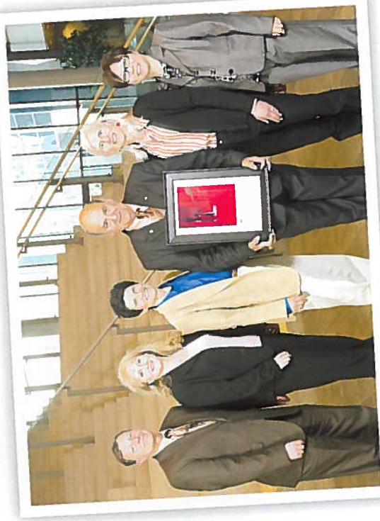
"The city received Puget Sound Regional Council's Vision 2040 Award for helping to implement VISION 2040, the regional growth management, economic and transportation strategy."